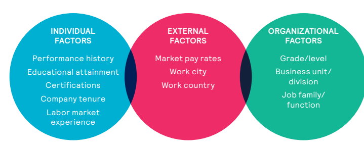
FIGURE 1: FACTORS DRIVING PAY DIFFERENCES

Leveraging your organization's HR information system, Mercer gathers information on individual, organizational and external factors that are known to explain pay differences and which are deemed legally defensible (see Figure 1).